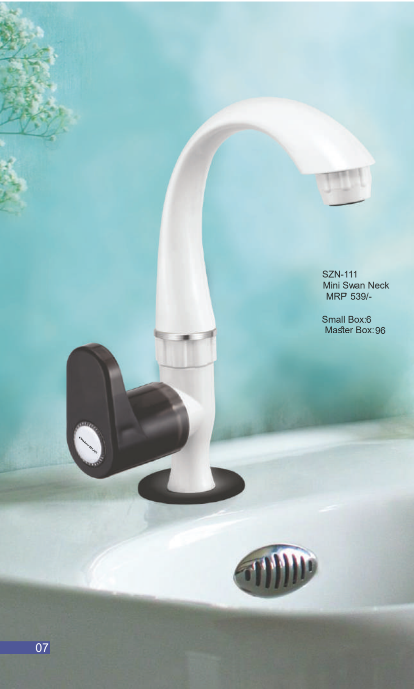
SZN-111 Mini Swan Neck MRP 539/-