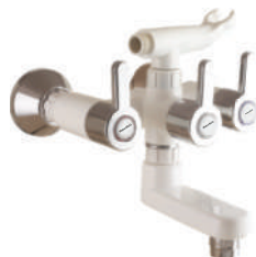
Wall Mixer Crutch