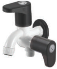
2 in 1 BibCock with Flange MRP 425/-