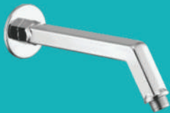
Cat. No: WSA-001 Square Shower Arm (ABS with Chrome) MRP 210/-