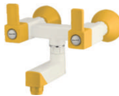
Wall Mixer Non-Telephonic