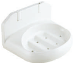
Soap Dish MRP 190/-