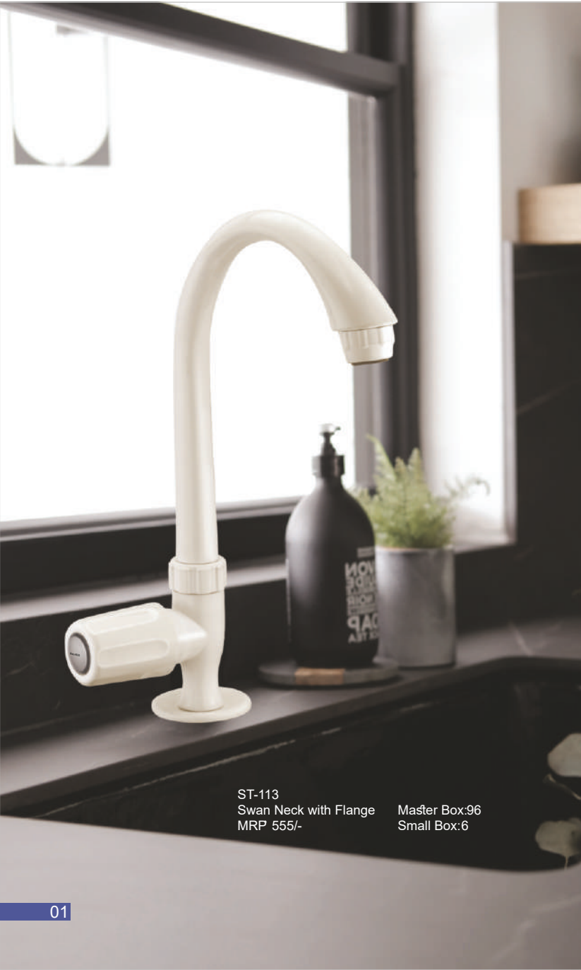
ST-113 Swan Neck with Flange MRP 555/- Master Box:96 Small Box:6