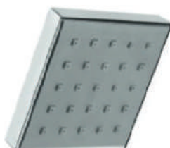
Square Shower 4"x4" MRP` 565/-