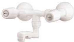
Wall Mixer Non-Telephonic