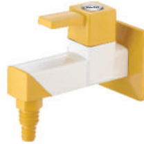
Bib Cock Nozzle with Flange