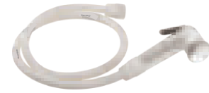
Classic Health Faucet (withT/H) MRP` 480/-