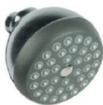
Bell Shower 3" MRP` 468/-