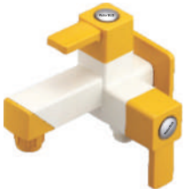
2 in 1 Bib Cock with Flange