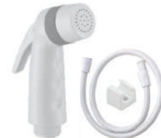
MINI HEALTH FAUCET 1 MTR MRP` 480/-