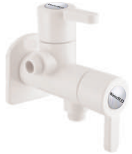
Two Way Angle cock MRP 630/-