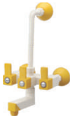
Wall Mixer with L-Bend