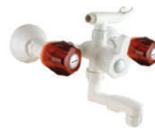
Wall Mixer with Crutch