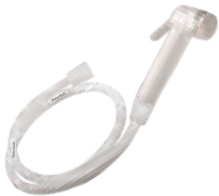
ROYAL CLASSIC HEALTH FAUCET 1 MTR MRP` 435/-