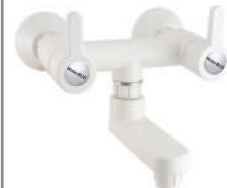
Wall Mixer Non-Telephonic MRP 1405/-