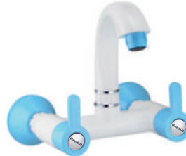
Sink Mixer MRP 1472/-