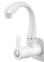
Sink Cock MRP 825/-