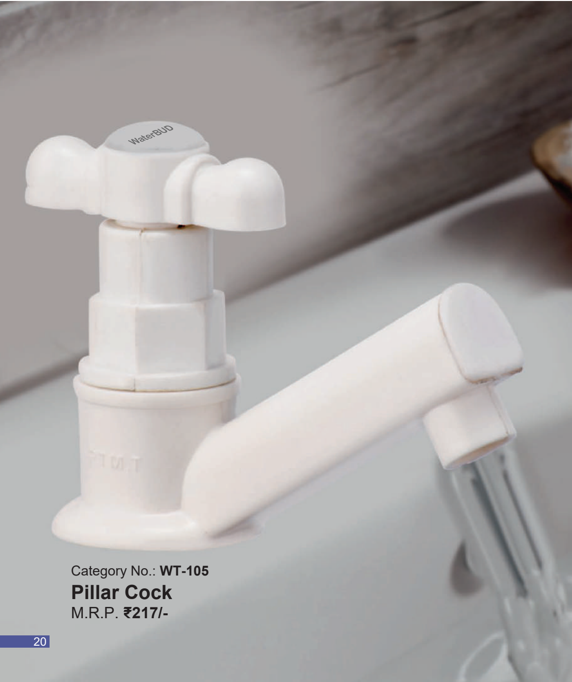
Category No.: WT-105 Pillar Cock M.R.P. ₹217/-