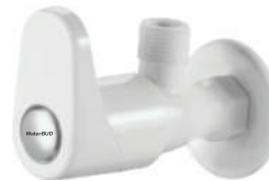
Angle Cock with Flange MRP 209/-