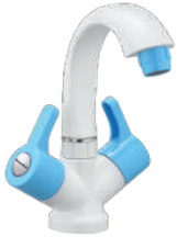
Centre Hole Basin Mixer MRP 1515/-