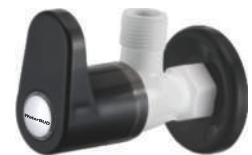
Angle Cock with Flange MRP 220/-