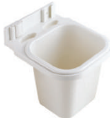
Tumbler Holder MRP 250/-