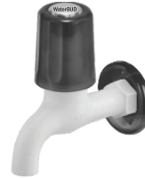
Bib Cock with Flange MRP 193/-