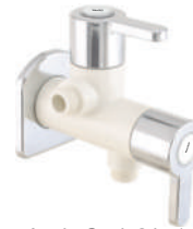
Angle Cock 2 in 1