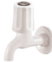
Bib Cock with Flange MRP 188/-