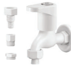
Washing Machine Faucet MRP 312/-