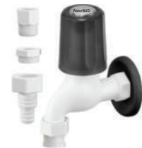
Washing Machine Faucet MRP 295/-