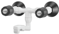
Wall Mixer Non-Telephonic MRP 1105/-