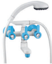
Wall Mixer Crutch MRP 1870/-