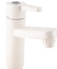
Single Lever Basin Mixer MRP 1750/-