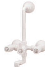
Wall Mixer with L-Bend