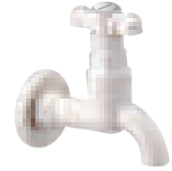
Bib Cock MRP 190/-