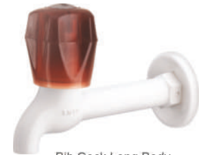
Bib Cock Long Body