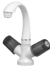
Center Hole Basin Mixer MRP 1311/-