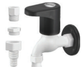
Washing Machine Faucet MRP 327/-