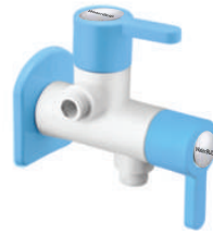
2 WAY ANGLE COCK MRP 637/-