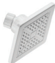
P.T.M.T Square Shower 4"x4" MRP` 300/-

Cat. No.: WOS-409 P.T.M.T Overhead Shower 4"x4" MRP` 500/-