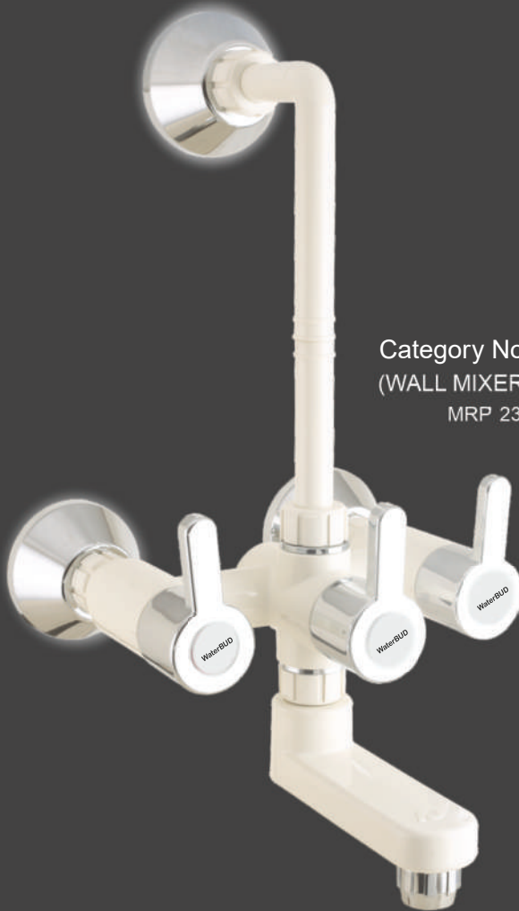
Category No.: PC-114 (WALL MIXER WITH L- BEND) MRP 2329/-