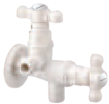
Two Way Angel Cock