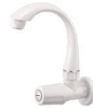
Mini Sink Cock