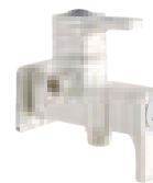
2 IN 1 ANGLE COCK MRP 475/-