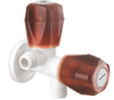
2 Way Angle Cock