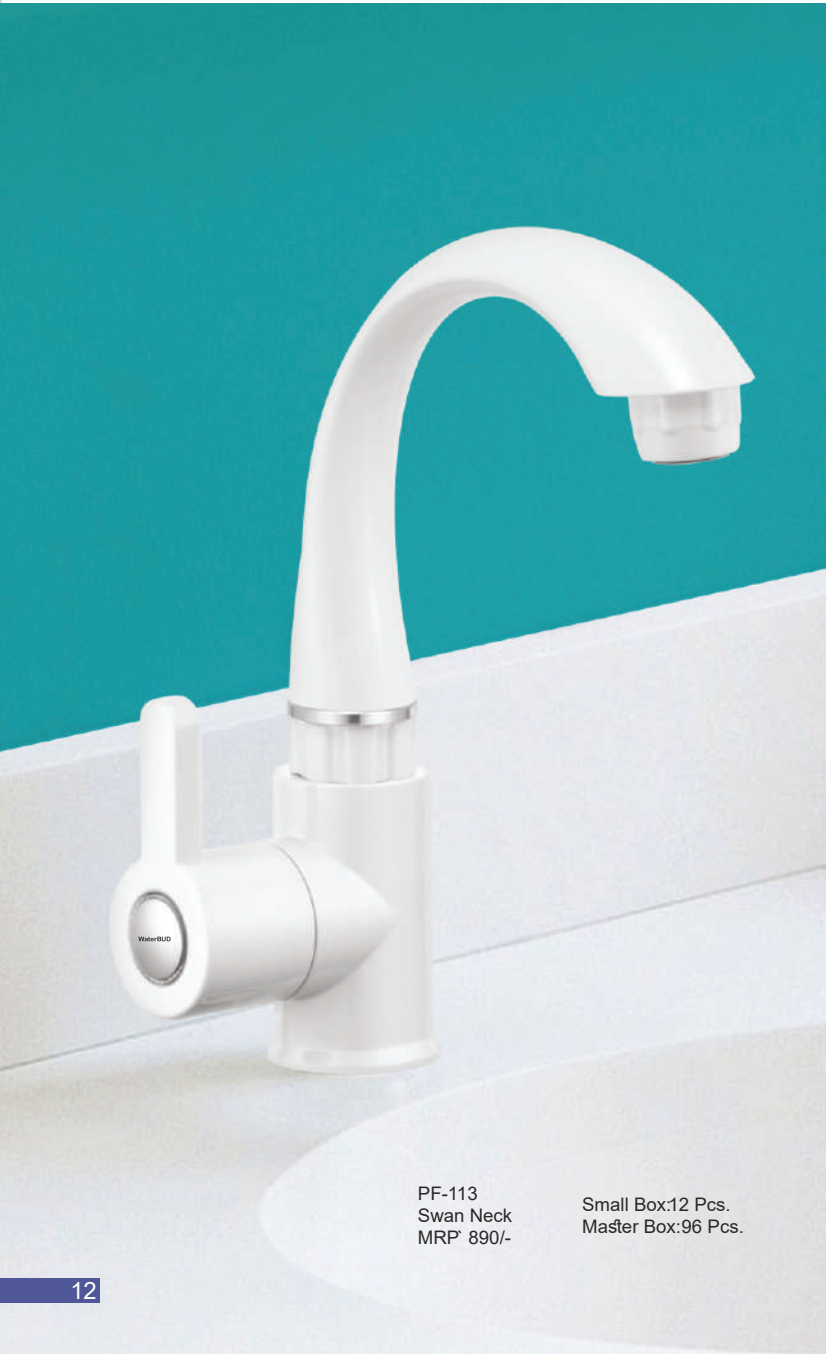
PF-113 Swan Neck MRP 890/-