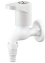
Bib Cock Nozzle with Flange MRP 229/-