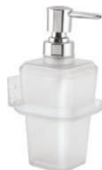
Soap Dispenser (SQ) MRP 240/-