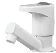
Pillar Cock MRP 250/-