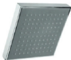
Square Shower 6"x6" MRP` 1530/-