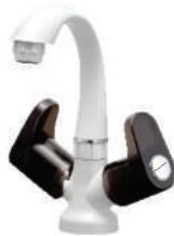
Center Hole Basin Mixer MRP 1353/-