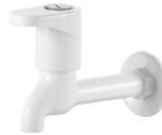
Bib Cock Long Body MRP 235/-