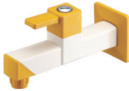
Bib Cock Long Body with Flange