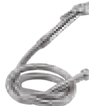
Alfa (withT/H) MRP` 535/-