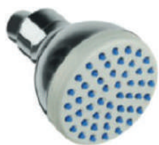
Round Shower 3" MRP` 478/-