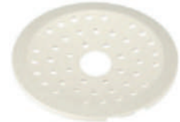
P.T.M.Tjalli Cut WJC-007 | 100 MM | MRP' 55/- WJC-008 | 125 MM | MRP' 65/- S. Box:20 Pcs. | M. Box: 640 Pcs.