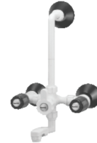
Wall Mixer with L-Bend MRP 1402/-