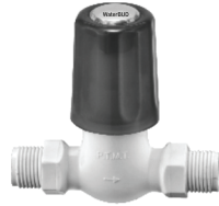
Stop Cock M/T MRP 193/-