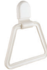
Towel Ring MRP 150/-