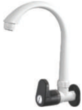
Sink Cock with Flange MRP 549/-