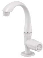
Mini Swan Neck