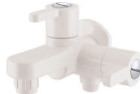
Two Way Bib Cock MRP 690/-