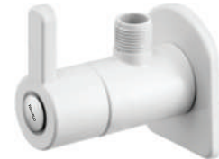
Angle Cock MRP 299/-