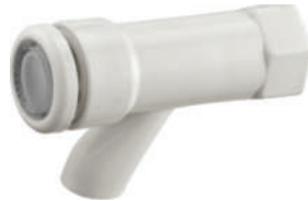
Push Cock Cat. No WPC-002 | MRP' 167/- S. Box:60 Pcs. | M. Box:720 Pcs.