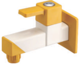
Bib Cock with Flange