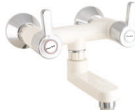
Wall Mixer NonTelephonic