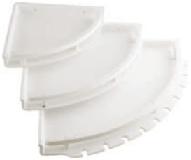
CORNER SET 3 PIECE MRP 580/-