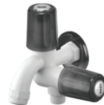
2 in 1 Bib Cock with Flange MRP 427/-