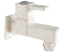
Bib Cock MRP 280/-