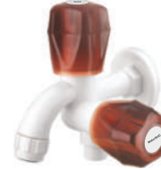
2 in 1 Bib Cock