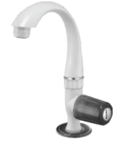
Mini Swan Neck MRP 510/-