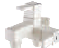
2 IN 1 BIB COCK MRP 522/-