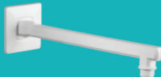
Cat. No: WSA-002 Square Shower Arm (P.T.M.T.) MRP* 199/-