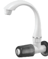
Mini Sink Cock MRP 500/-