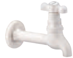
Bib Cock Long Body MRP 202/-