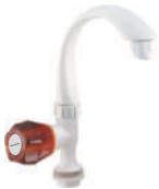
Mini Swan Neck