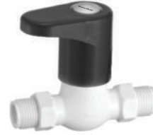
Stop Cock M/T MRP 220/-