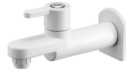
Bib Cock Long Body MRP 445/-