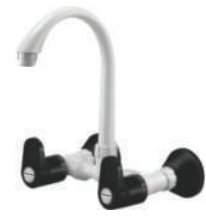
Sink Mixer MRP 1385/-