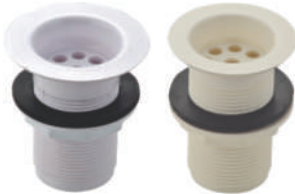
Waste Coupling Full Thread 1.2" Cat. No WWC-001 | MRP' 99/- S. Box:30 Pcs. | M. Box:360 Pcs.