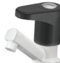
Pillar Cock MRP 270/-