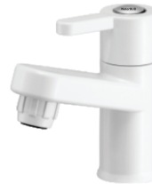
Pillar Cock MRP 500/-