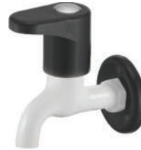
Bib Cock with Flange MRP 220/-