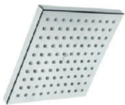
Square Shower 8"x8" MRP` 2080/-