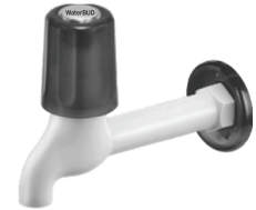
Bib Cock Long Body with Flange MRP 230/-