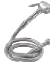
Volta (withT/H) MRP` 620/-