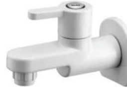
Bib Cock with Flange MRP 399/-