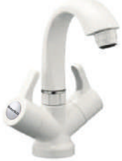
Centre Hole Basin Mixer MRP 1490/-