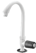
Swan Neck with Flange MRP 560/-