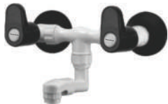
Wall Mixer Non-Telephonic MRP 1252/-