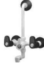
Wall Mixer with L-Bend MRP 1479/-