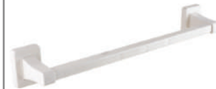
Towel Rail 24" MRP 460/-