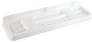
SHELF 18 MRP 535/-