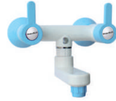
Wall Mixer Non-Telephonic MRP 1413/-