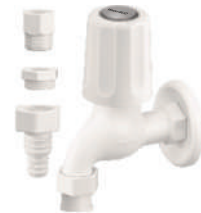
Washing Machine Taps MRP 288/-