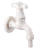
Bib Cock Nozzle MRP 203/-