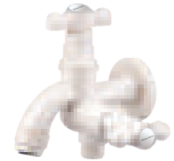
Two Way Bib Cock