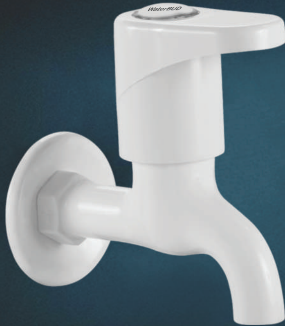
ZN-101 Bib Cock with Flange MRP 209/-