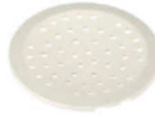
P.T.M.Tjalli Plain WJP-005 | 100 MM | MRP' 55/- WJP-006 | 125 MM | MRP' 65/- S. Box:20 Pcs. | M. Box:640 Pcs.