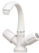
Center Hole Basin Mixer