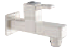
Long Body MRP 328/-