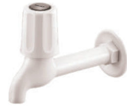
Bib Cock Long Body MRP 230/-