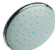
Round Shower 6" MRP` 815/-