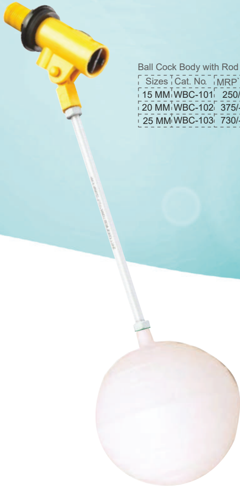
Ball Cock Body with Rod & Ball