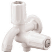
2 in 1 Bib Cock with Flange