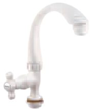
Mini Swan Neck