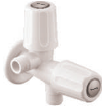
2 Way Angle Cock with Flange