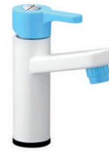
Single Lever Basin Mixer MRP 1772/-