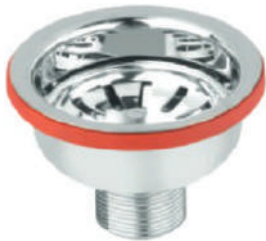
SS Kitchen Sink Coupling Heavy 4" Cat. No: WKS-013 | MRP 328/- S. Box:24 Pcs. | M. Box:288 Pcs.