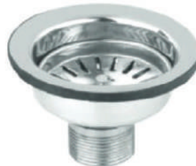
SS Kitchen Sink Coupling Lite 4" Cat. No.: WKS-013 | MRP 188/- S. Box:24 Pcs. | M. Box:288 Pcs.