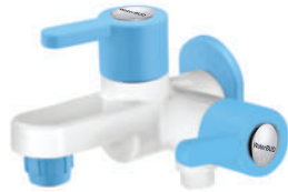
2 WAY BIB COCK MRP 703/-