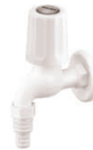
Bib Cock Nozzle MRP 211/-