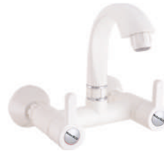
Sink Mixer MRP 1455/-