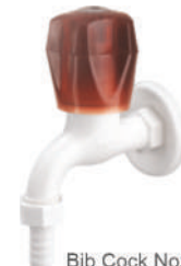
Bib Cock Nozzle