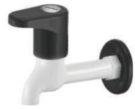
Bib Cock Long Body with Flange MRP 252/-