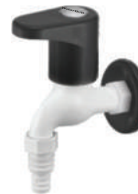
Bib Cock Nozzle with Flange MRP 235/-