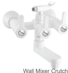
Wall Mixer Crutch MRP 1850/-