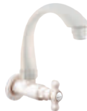
Mini Slnk Cock