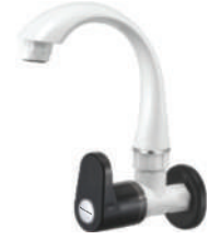
Mini Sink Cock MRP 530/-