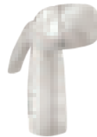
CANDY HEALTH FAUCET 1 MTR MRP` 420/-