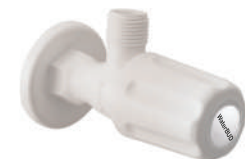
Angle Cock with Flange MRP 188/-