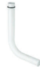
Long Bend Cat. No.: WLB-012 MRP 172/- Master Box:82 Pcs.