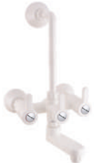
Wall Mixer L Bend MRP 1860/-