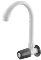
Sink Cock with Flange MRP 555/-