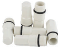
PVC Plug - 15 MM Cat. No WPP-010 MRP 7.5/- S. Box:100 Pcs. | M. Box:3000 Pcs.