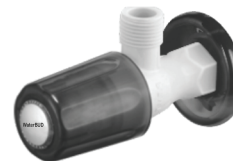
Angle Cock with Flange MRP 193/-