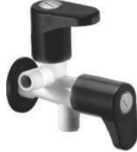
2 Way Angle Cock with Flange MRP 400/-