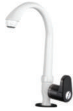
Swan Neck with Flange MRP 600/-