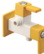
2 Way Angle Cock with Flange