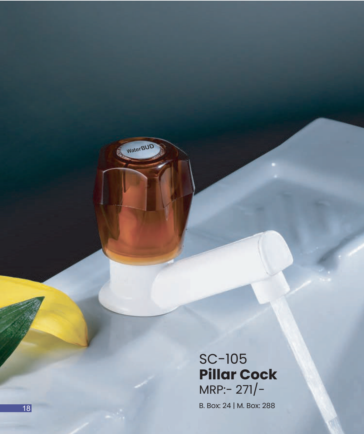
SC-105 Pillar Cock MRP:- 271/-