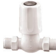
Stop Cock Male