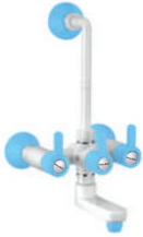
Wall Mixer L Bend MRP 1880/-