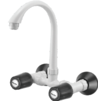
Sink Mixer MRP 1103/-