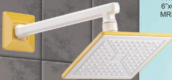
Cat. No: WOS-410 P.T.M.T. Overhead Shower 6"x6" MRP* 520/-