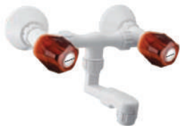
Wall Mixer Non Telephonic