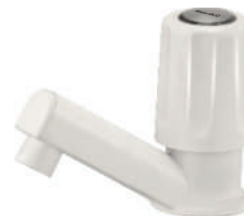
Pillar Cock MRP 260/-