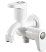
2 in 1 Bib Cock with Flange MRP 420/-