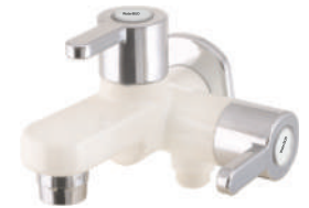
Bib Cock 2 in 1