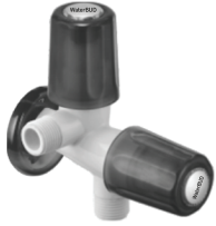
2 Way Angle Cock with Flange MRP 395/-