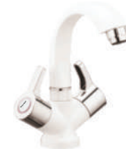
Center Hole Basin Mixer