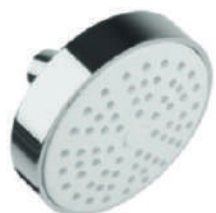
Gloria Shower 4" MRP` 510/-