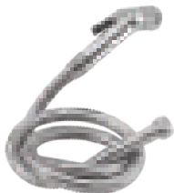
Neo (withT/H) MRP` 530/-